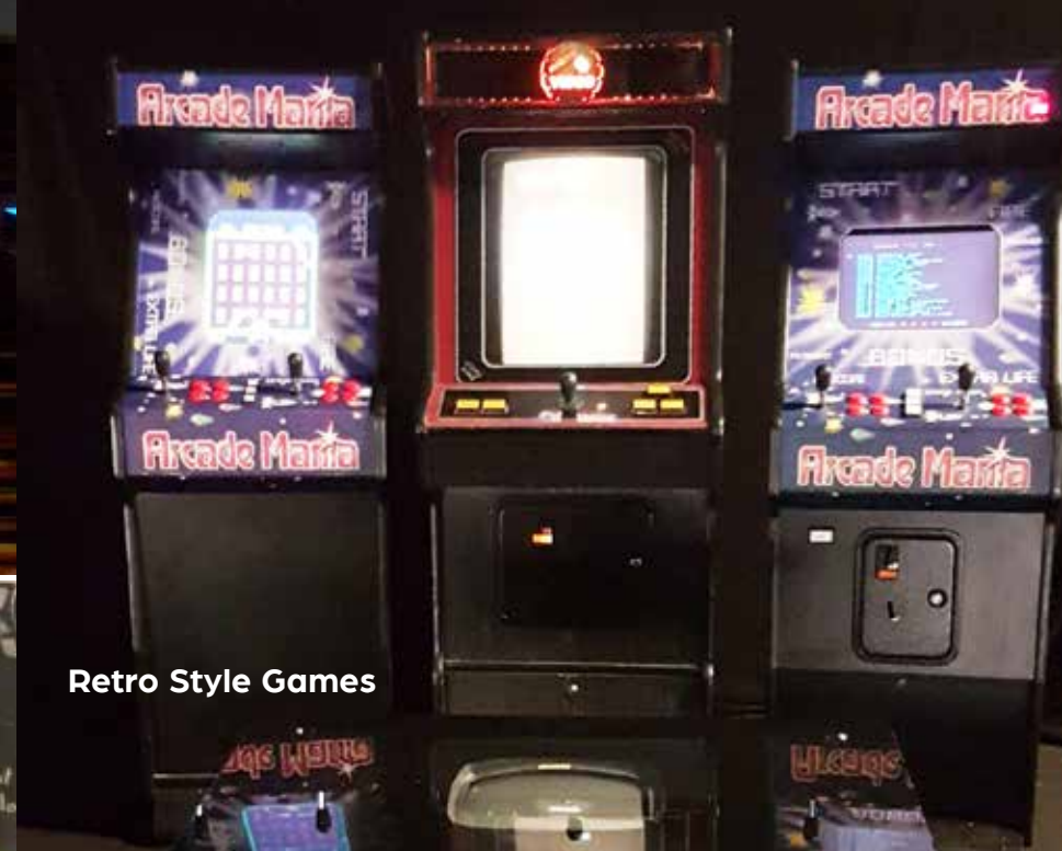
Retro Style Games