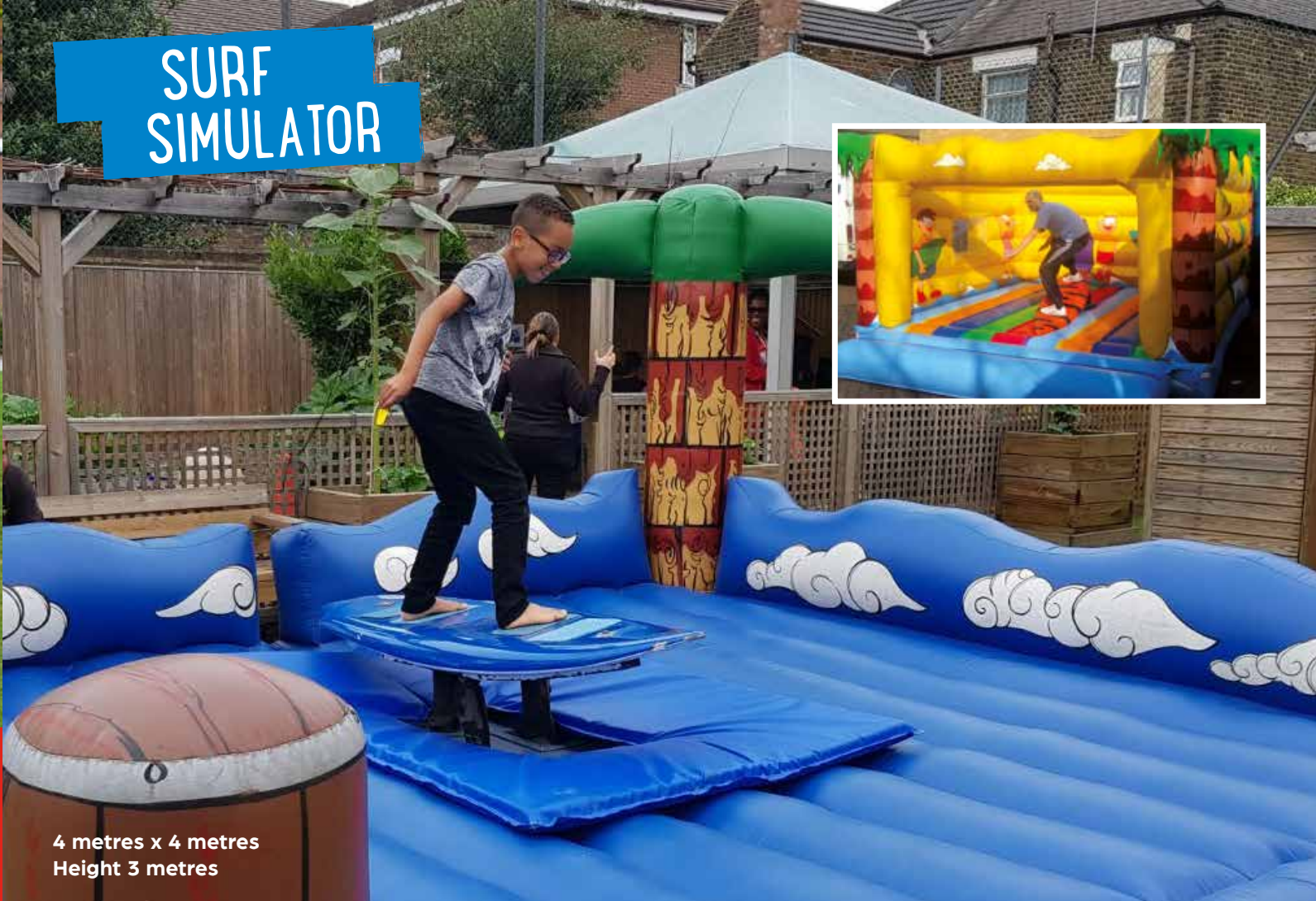
4 metres x 4 metres Height 3 metres

Our surf simulator is perfect for both indoor and outdoor events. Complete with a beach themed inflatable and brightly coloured surfboard, participants 'ride the waves' for as long as they are able!