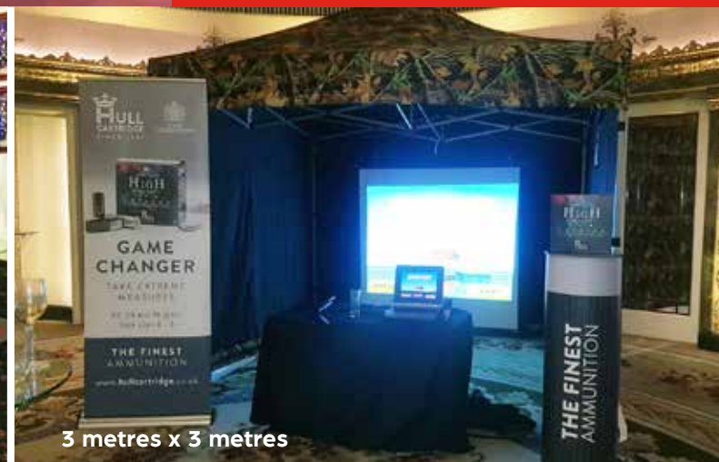
3 metres x 3 metres