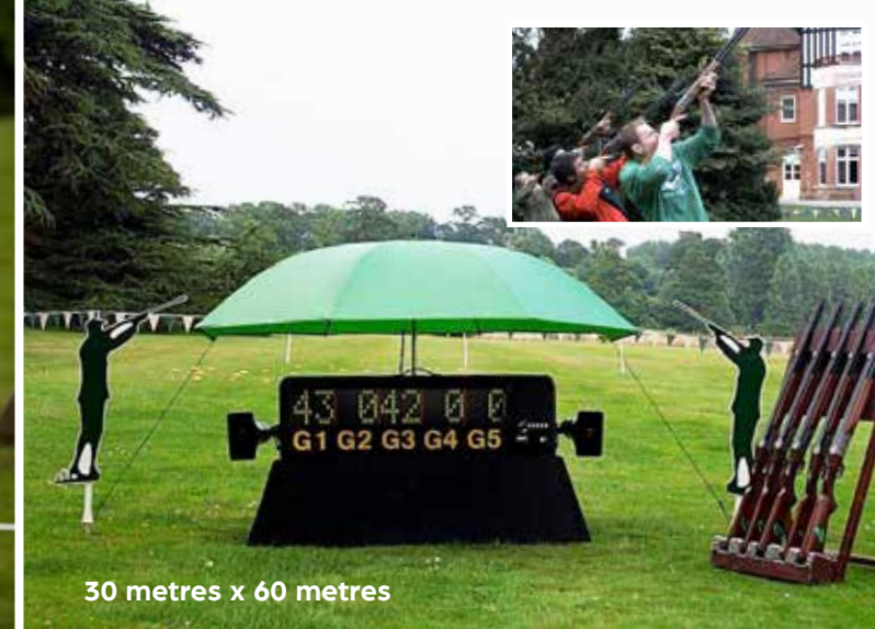
30 metres x 60 metres

Our qualified archery instructors will provide each participant with one on one instruction to get the most out of your archery experience. Everyone from complete beginners to seasoned archers are catered for.