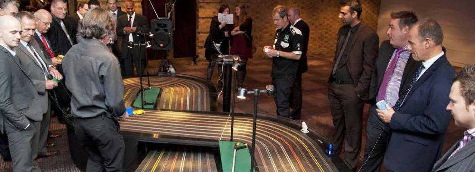
4 metres x 3 metres