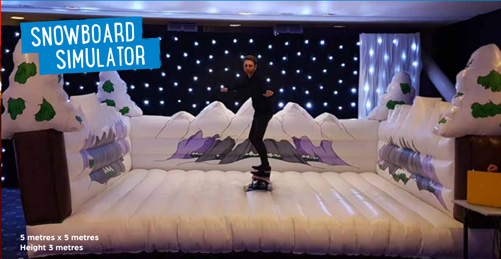
5 metres x 5 metres Height 3 metres

Complete with snow themed inflatable base, our snowboard simulator requires balance and agility to remain on the slopes as long as possible.