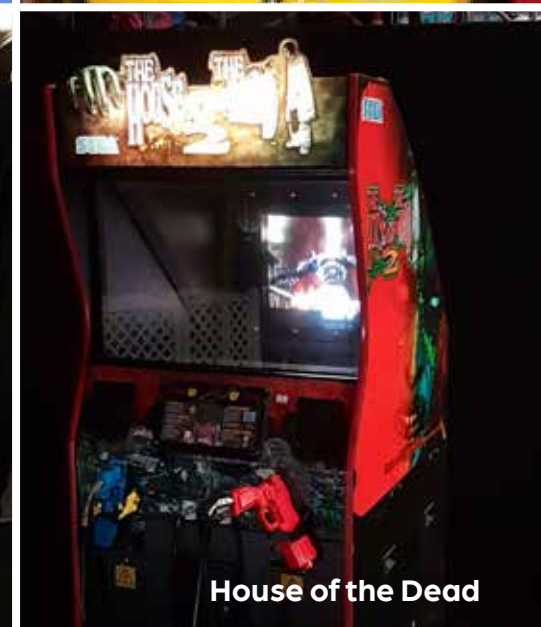
House of the Dead