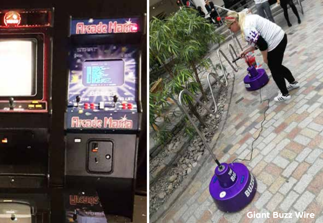
Giant Buzz Wire

Funtime has a large stock of pub style games available including: