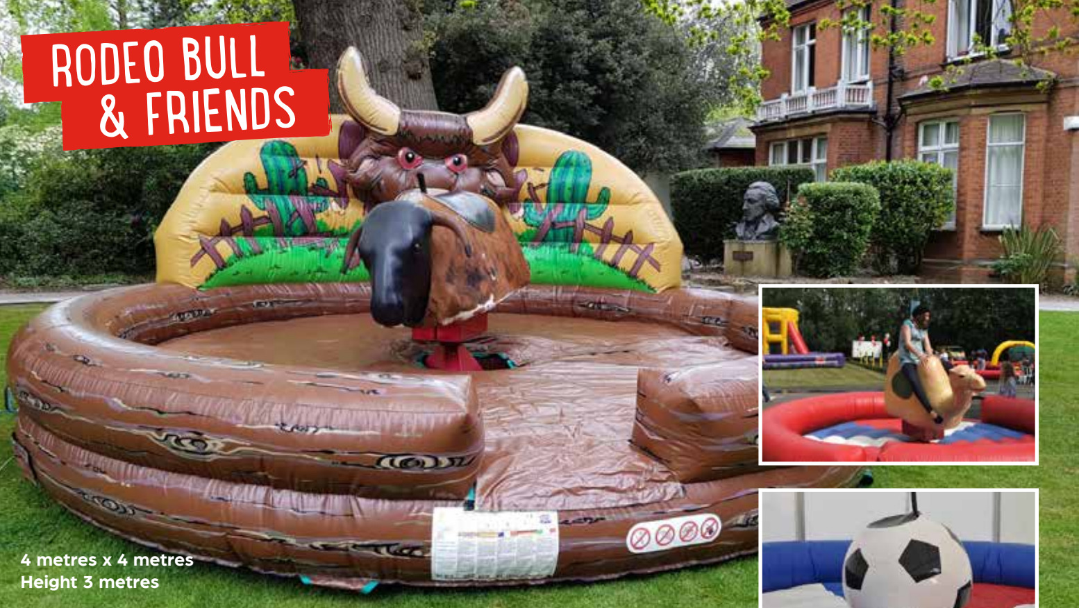
4 metres x 4 metres Height 3 metres

A traditional favourite, this American style ride offers many different attachments. Supplied with a fully trained operator, the ride gradually increases in difficulty and intensity.