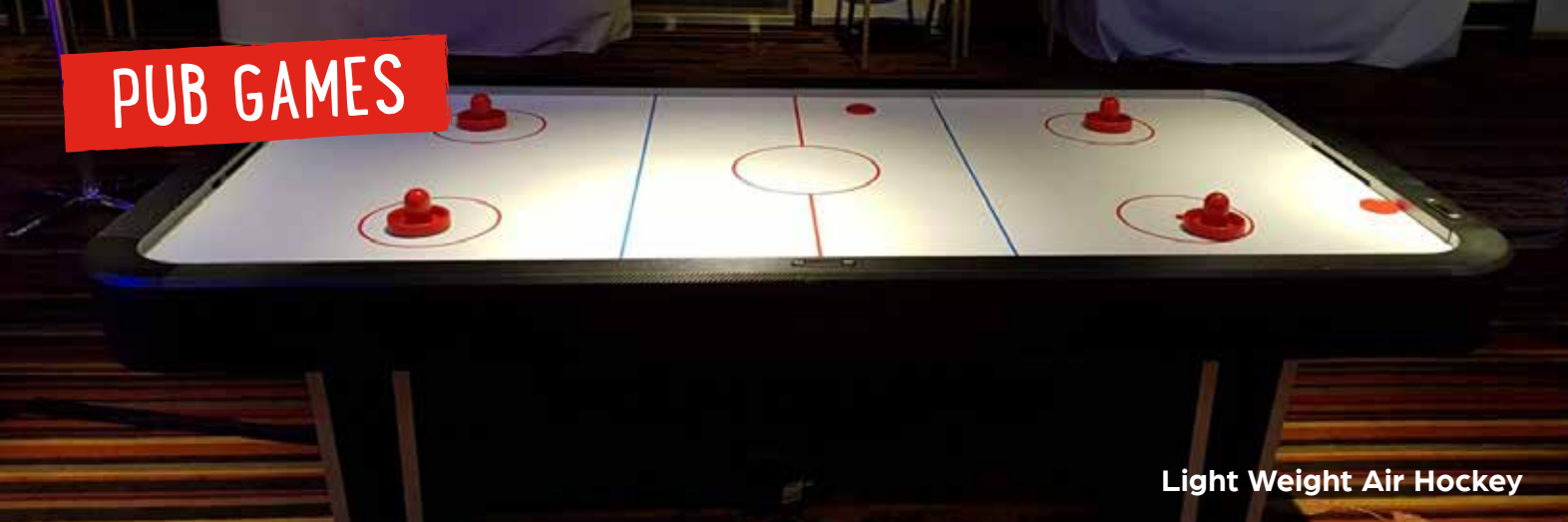
Light Weight Air Hockey